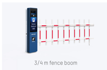
3/4 m fence boom