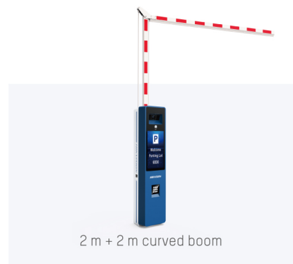
2 m + 2 m curved boom