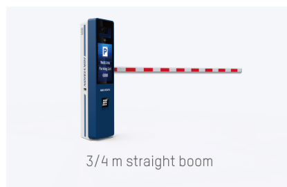
3/4 m straight boom