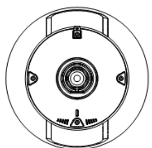
Unit: mm (inch)