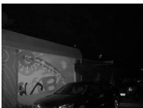
With IR light