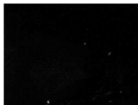
Without IR light