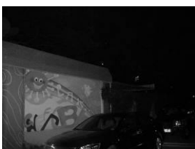
With IR light