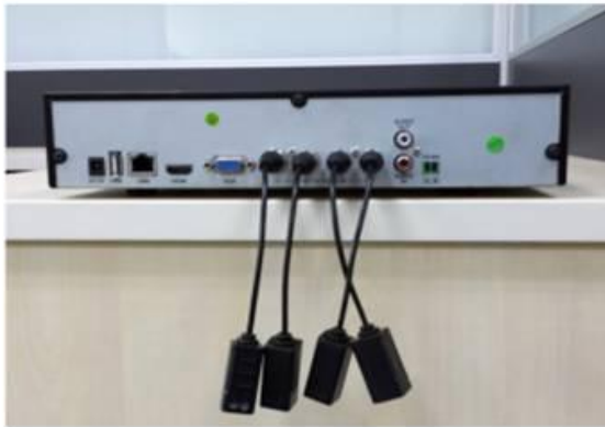
Old baluns make the cabinet a mess